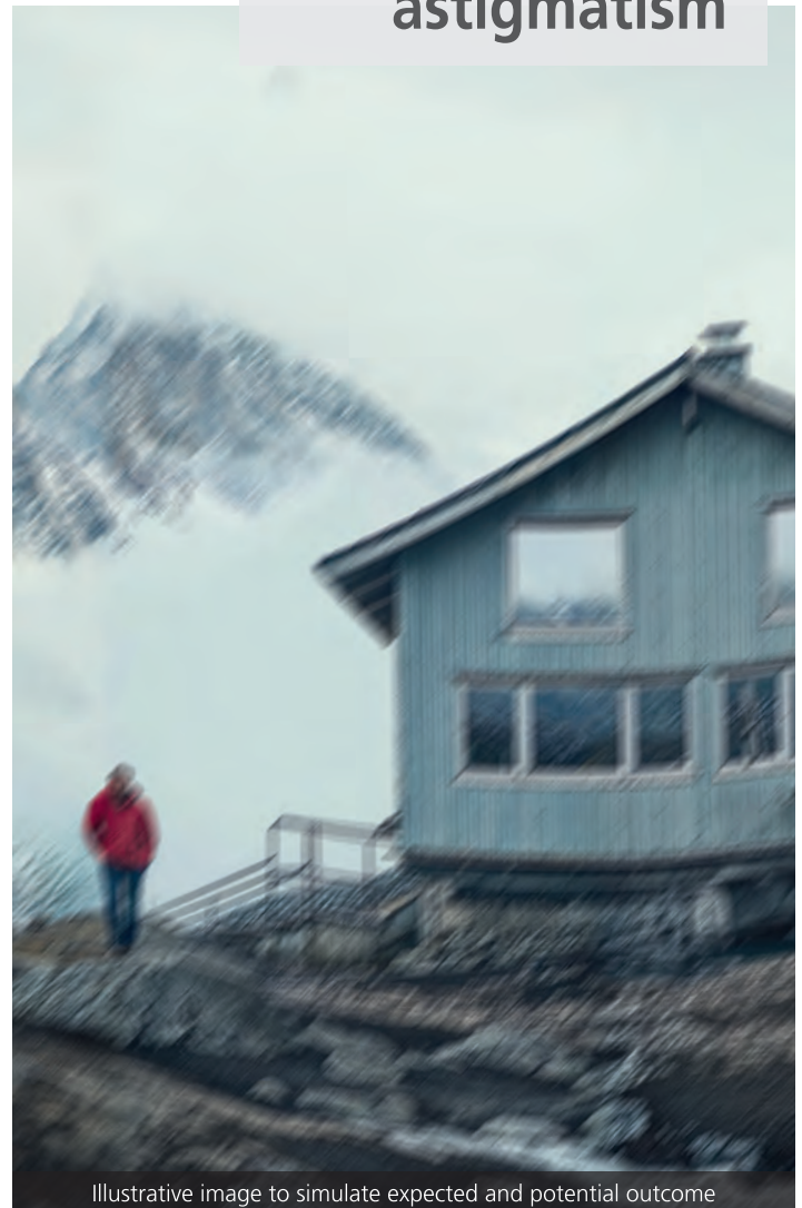
Illustrative image to simulate expected and potential outcome